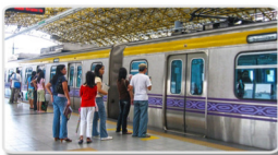
PUBLIC TRANSPORT FACILITIES