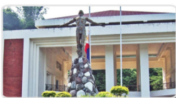
SCHOOL AND UNIVERSITIES