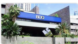
BANKS AND HOTELS