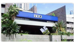
BANKS AND HOTELS